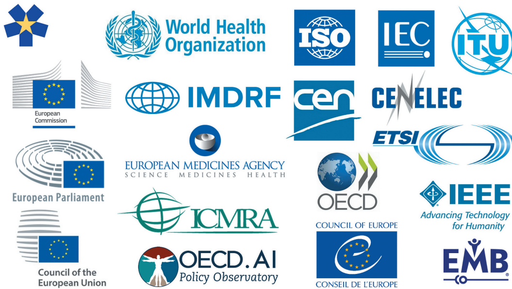
Figure 3. Overview of European and global institutions and organizations engaged in the development of regulations for medical AI systems.

Details of all these acronyms are given in the text.